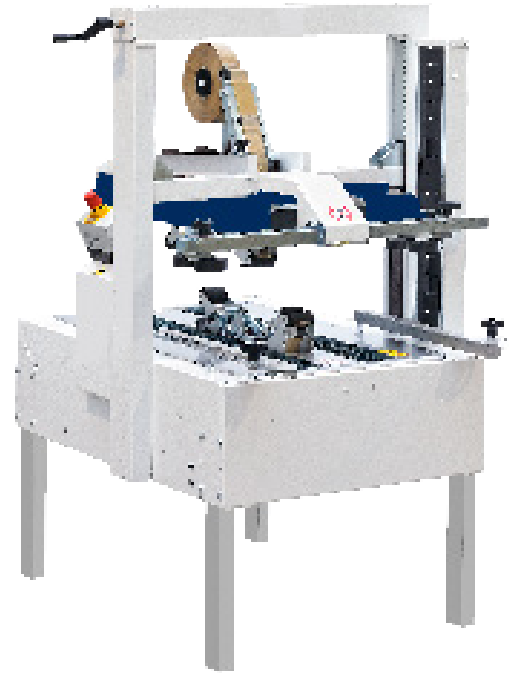
Standard version of the CT 303 TB